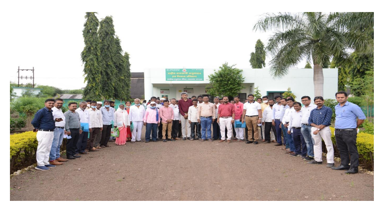
Organised filed visit to ICAR Onion SEEDS centre inLasalgaon for Farmers